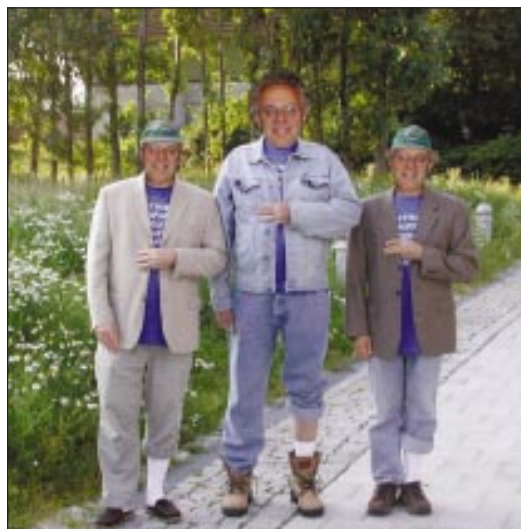
Fig 4 Three EBM druids dressed in their vestments

never washed, but are normally hidden underneath other clothing. The secret sign they are making with their hands is used to identify themselves to each other, the three fingers forming an "E" for evidence. EBMers are known to provide mutual assistance and promotion within their secret order, sometimes using a specific EBM vocabulary, including words such as "trohoc," and passwords such as "allocation concealment" and "RCT," the last of which is used as a title of reverence in place of the ineffable (randomised controlled trial).