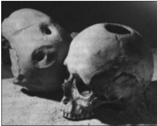
Fig 2 Skulls of medical students showing circular incisions of trepanation used to insert EBM cubes