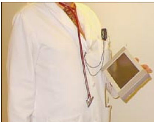
Fig 3 An EBM priest anointing a patient with evidence at the bedside

We are able to publish a photo of three EBM druids dressed in their vestments (fig 4). Note the socks, the shirts, and the sign they are making with their hands. EBMers are easily recognised by their white socks. The shirts seen in the photograph are worn at all times and