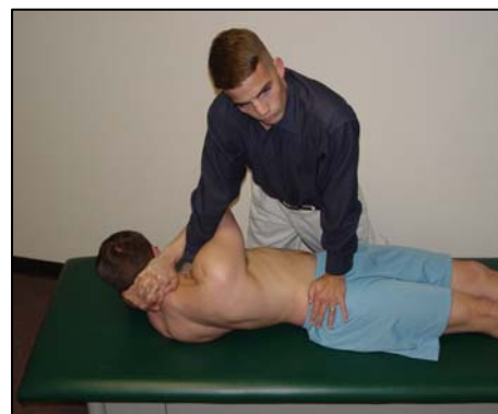
Figure 1. Lumbopelvic manipulation technique

We recently validated the spinal manipulation clinical prediction rule in a multicenter randomized clinical trial performed in physical therapy clinics across the country, the results of which were recently published in the Annals of Internal Medicine . 3 The study examined 131 patients with low back pain, 18 to 60 years of age, who were referred to care provided by physical therapists. Patients were randomly assigned to receive physical therapy that included two sessions of high-velocity thrust spinal manipulation plus an exercise program (manipulation + exercise group) or an exercise program without spinal manipulation (exercise only group).